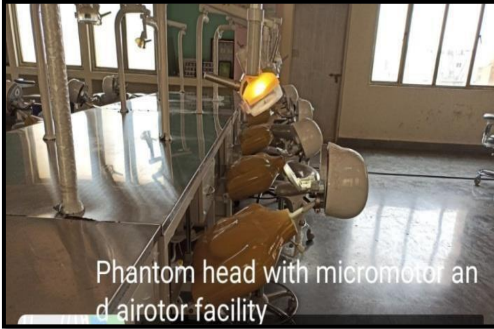
Phantom head with micromotor and airotor facility

E-mail: deandirectortodc@gmail.com Website: www.theoxford.edu