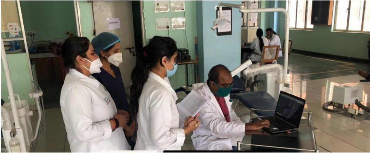
Basic implant training with CBCT images

E-mail: deandirectortodc@gmail.com Website: www.theoxford.edu